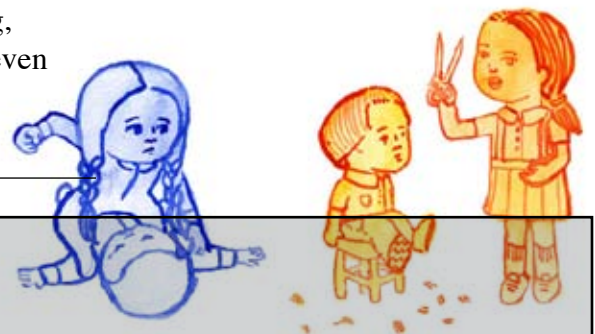
ILLUSTRATION BY JESSICA FINDLEY